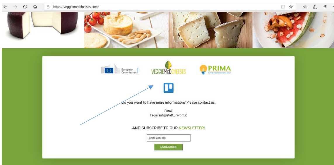
Fig.1 Footer of VEGGIE-MED-CHEESES public site with visual link to VEGGIE-MED-CHEESES private platform based on TRELLO.

A visual link (indicated by the arrow) in the footer of the home page of the VEGGIE-MED-CHEESES website (Fig. 1) allows access – exclusively with credentials (Fig. 2) - to the VEGGIE-MED-CHEESES intranet; the latter has been implemented by exploiting TRELLO, a free visual tool for organizing and managing projects, in a collaborative approach. More details on trello are given at https://trello.com .